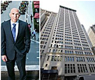
RXR takes $290M mortgage on 61 Broadway