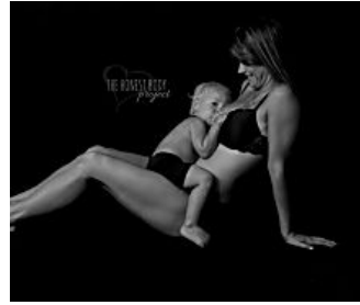
9 Gorgeous Photos of Moms Breastfeeding Beyond 12 Months From 'The Honest' The Stir