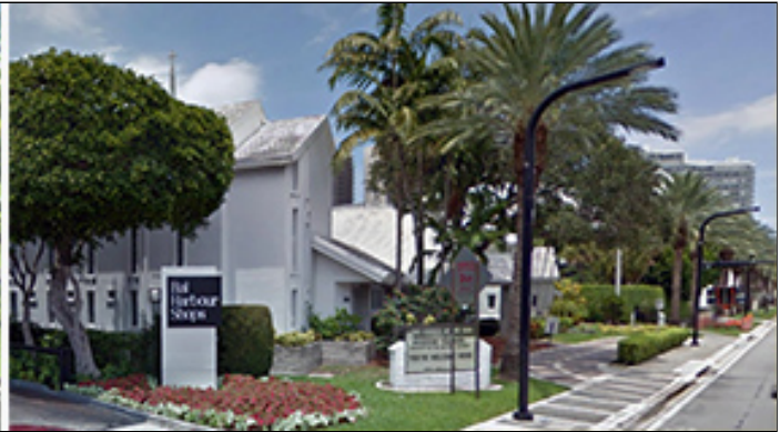
Rendering of Bal Harbour Shops, and a photo of the previous Church by the Sea

Bal Harbour Shops has purchased the Church by the Sea's lot for $30 million, marking another step forward for Whitman Family Development's expansion plans for the upscale shopping center.