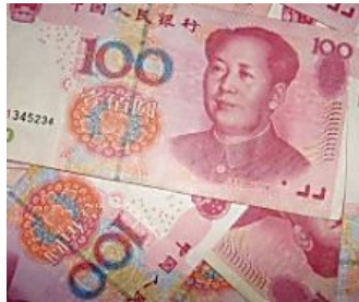
EB-5 is a bonanza for banks therealdeal.com