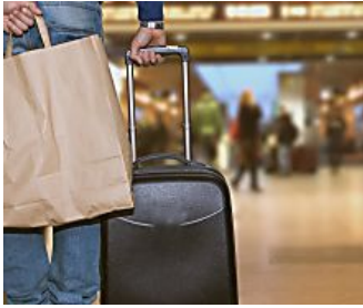
Paqy Uses Random People as Couriers to Shake Up The Package Delivery Industry SnapMunk