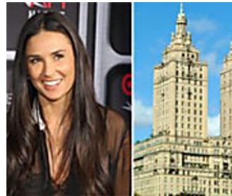
A peek inside Demi Moore's $75M San Remo penthouse therealdeal.com