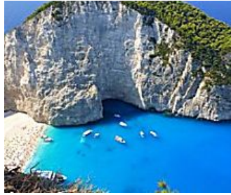
The Top 10 Trips To Take In Your Lifetime Lost Waldo