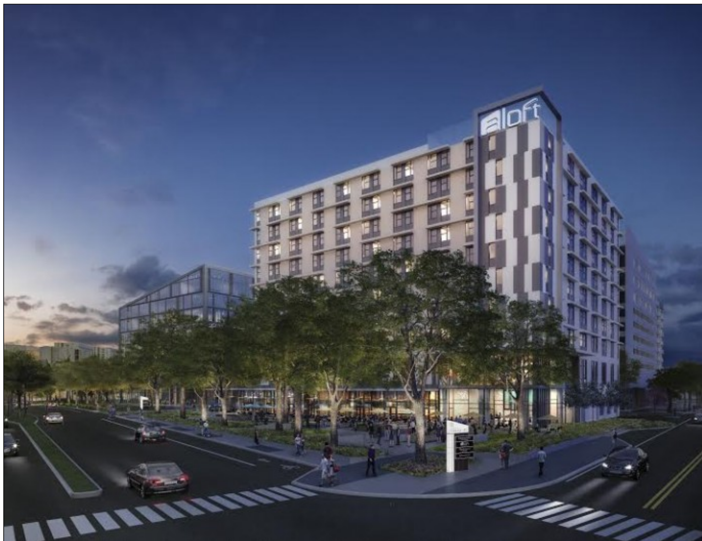
Aloft at Aventura ParkSquare

Norwich Partners has closed on $37 million in construction financing for an Aloft hotel at Aventura ParkSquare, a mixed-use project that's being developed by Integra Investments.